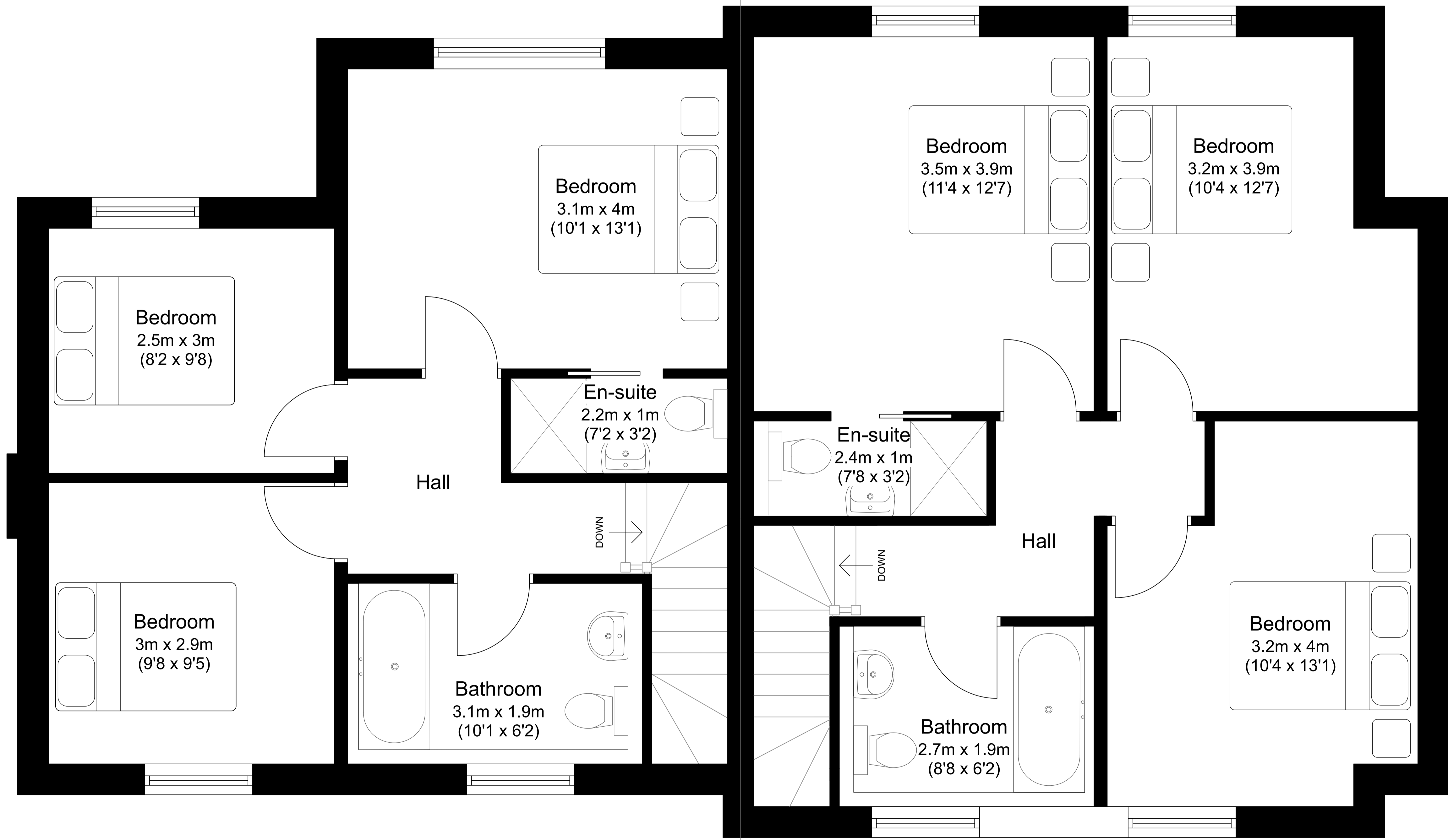
→ z PLOT 16 - FIRST FLOOR APPROX GROSS AREA 47 sqm / 506 sqft